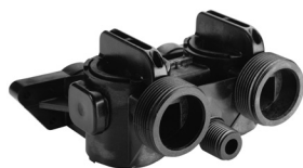
1265 Manual Bypass Valve